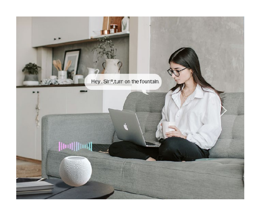
*No hub needed when used in Tapo. Yet if you use it in a third-party app, a Matter hub is needed.

Free up your hands by using simple voice com-mands with Alexa, Siri®, or Google Assistant.